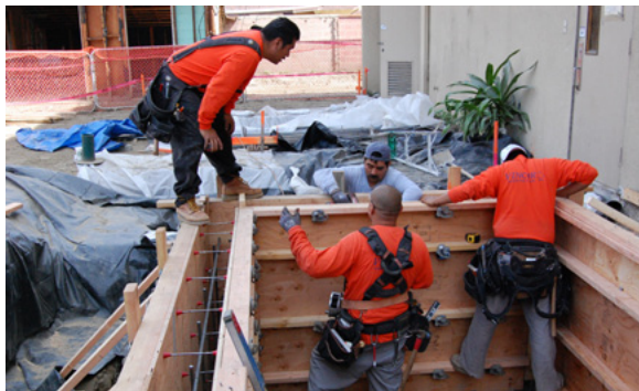
Forming the elevator wall