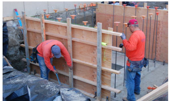
Carpenters forming the elevator wall