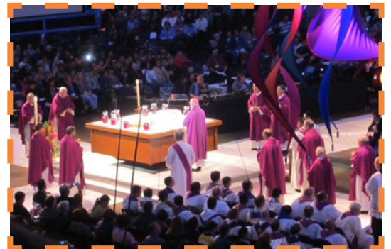
Closing Liturgy in the Convention Arena